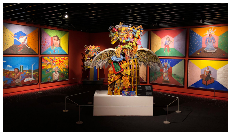
Display of "An Angel in New York" and "Arabesque"

"The Morning Sun, Mt. Fuji and Two Dragons Each Gripping a Ball - Dharma-Gate of Non-Duality", made in 2019, is an imposing masterpiece measuring over 2m high and 3m wide. Mt. Fuji (can