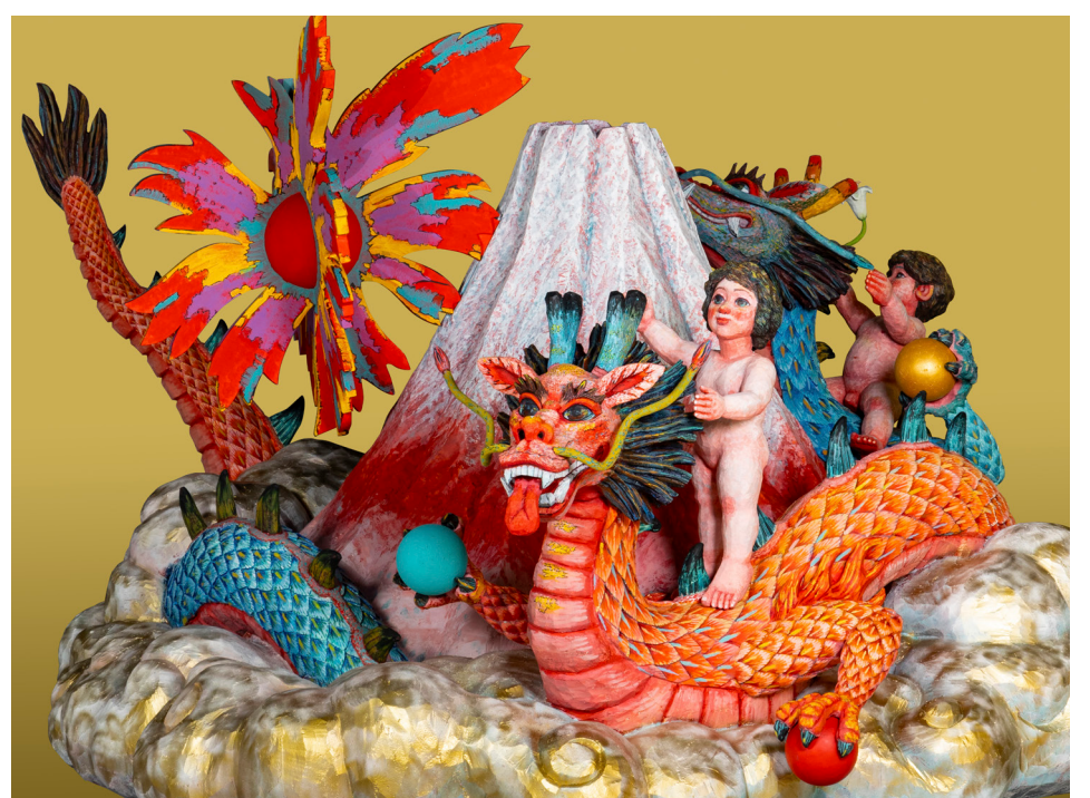
The Morning Sun, Mt. Fuji and Two Dragons, Each Gripping a Ball-Dharma-Gate of Non-Duality 2019 Styrofoam Mixed media work

The Dharma-Gate of Non-Duality is at the core of the Vimalakirti Sutra, explaining that conflicting concepts such as good and bad, beautiful and ugly, life and death, or war and peace are originally parts of one entity. It urges us to accept their mutual